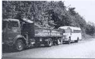
The school bus being towed away from where it broke down in the middle of nowhere