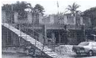
The 2nd floor of the three-story building now at decking stage

All that notwithstanding, I have some good news for you. This may seem ironic but while some parents find it difficult to pay the equivalent of $30.00 a year for their children in primary school, more and more are willing to make the sacrifice to pay the equivalent of $40.00 monthly to have theirs in our high school. Consequently, instead of the number of 30 new students we expected last year, we had 35. And for next year, it is likely that we will not be able to admit all those who have applied. Word has gotten around about the school. A couple of days before I came out this year, precisely on June 10, government officials came to inspect our secondary school for approval. In the end they assured us that we would get the approval.