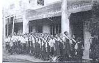
The secondary school students holding the morning assembly in front of the story building